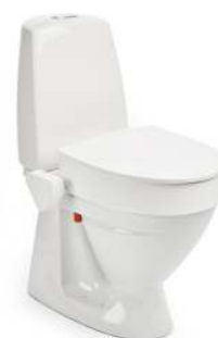
My-Loo 10 cm