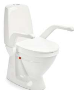
My-Loo with armrests 6 cm