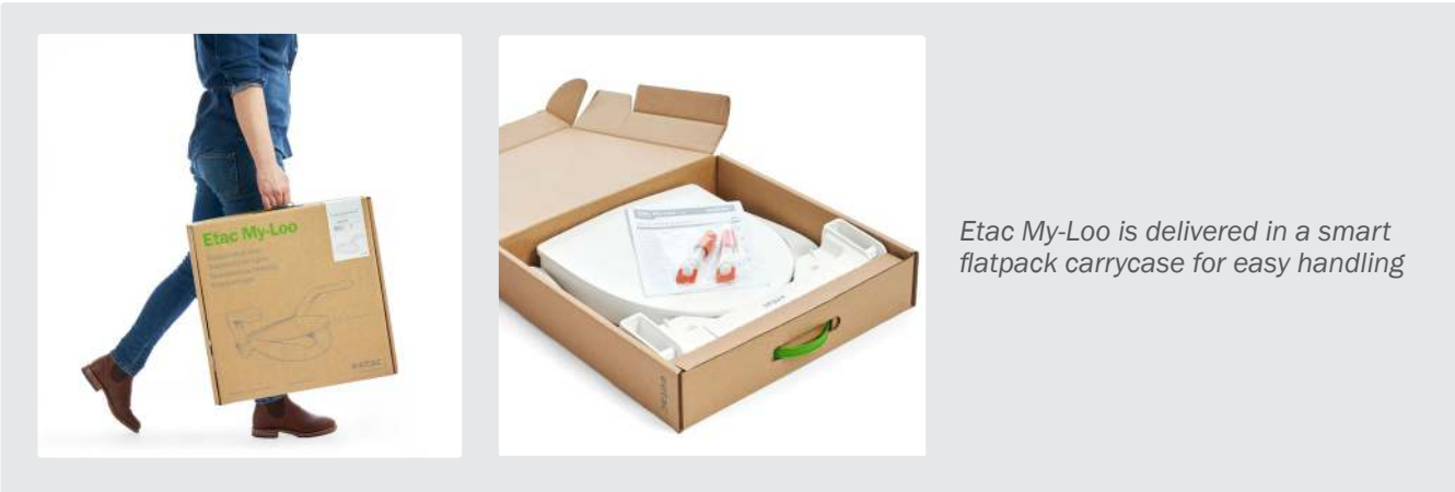
Etac My-Loo is delivered in a smart flatpack carrycase for easy handling