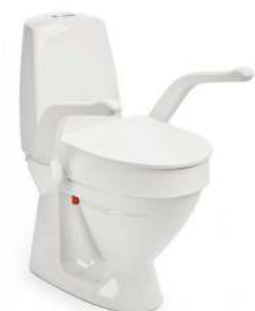
My-Loo with armrests 10 cm