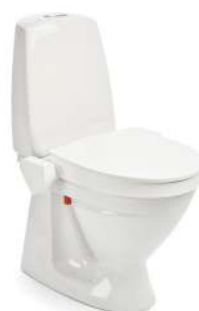
My-Loo 6 cm