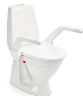
My-Loo with armrests 2 cm

The clean, smooth surfaces are easy to wipe with a soft cloth. Should separate cleaning be required, the seat and armrests are easy to remove from their brackets and equally simple to put back in place.